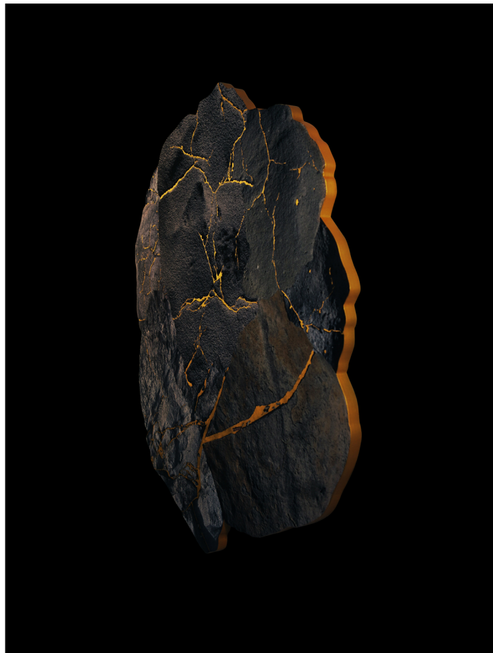
side view with low light